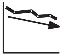
Confidence Factor LOW