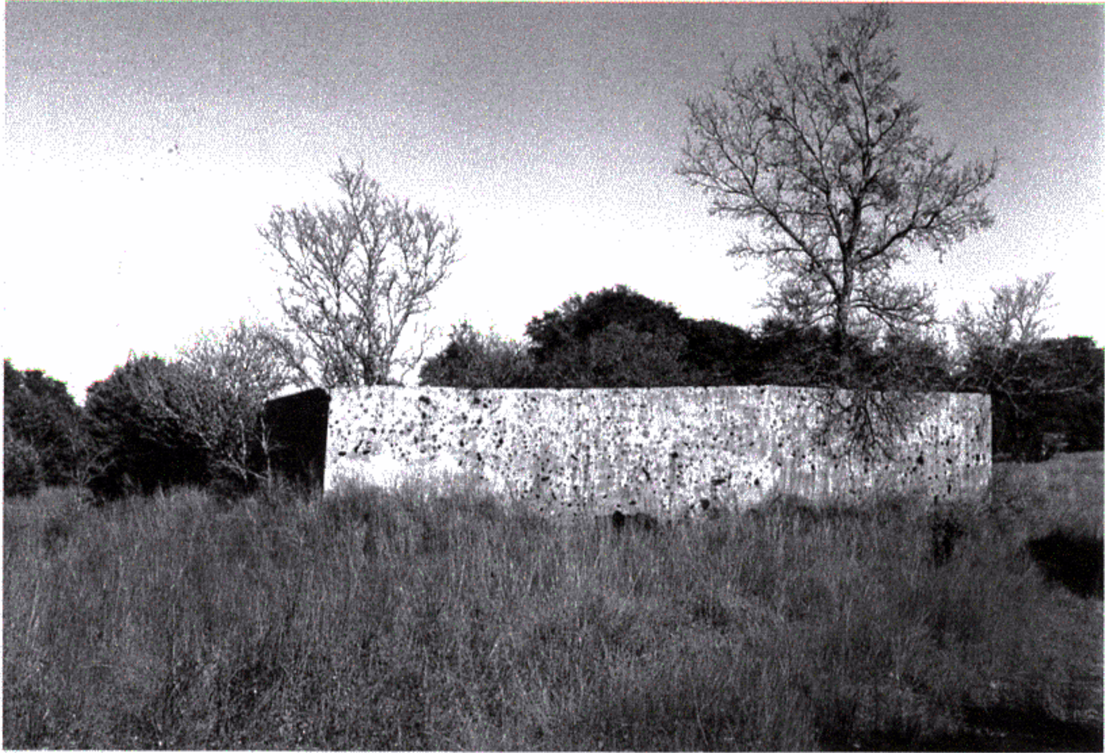
Photo 3: World War II era training facilities located in southeast section of CSSA.