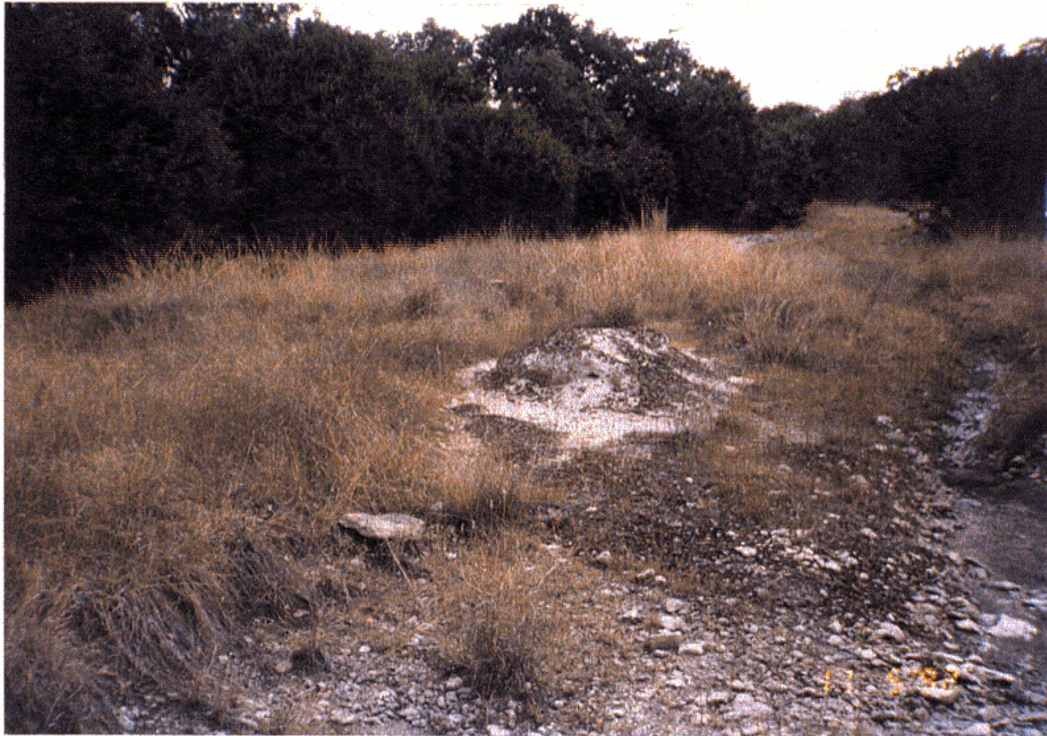
Photo 19: B-21, Disposal area for small arms ammunition containing shells, projectiles, and sand.