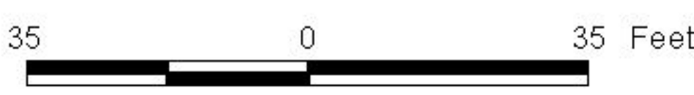
Figure 3.1 AOC-65 Treatability Study Location of Piezometers and SVE Wells Camp Stanley Storage Activity