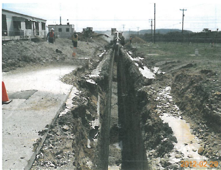
Figure 3. AOC-65 Trench Installation

In August 2012, the initial injection of approximately 15,000 gallons of ISCO material was performed. The laboratory results indicated that the treatment process is capable of dislodging and oxidizing/reducing contaminants present in the surrounding bedrock.